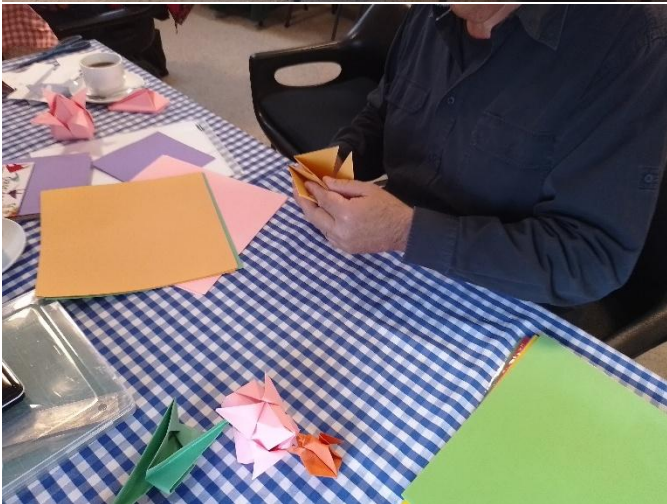
Perfecting the art of paper tulip making – almost!