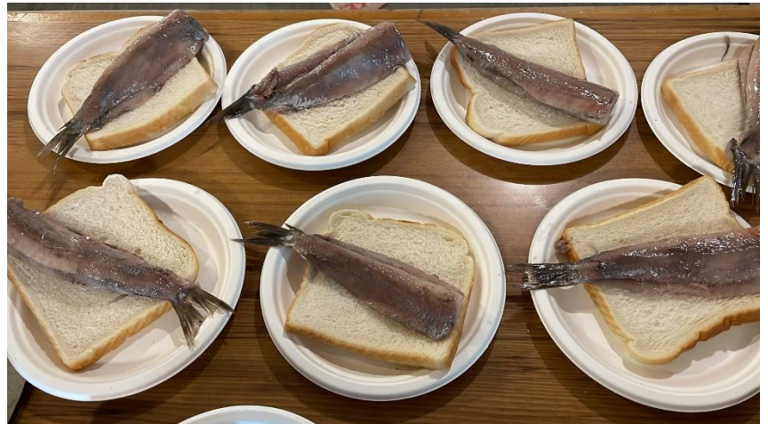
Above: 'Haring op witte brood' – await their adornment with onions.