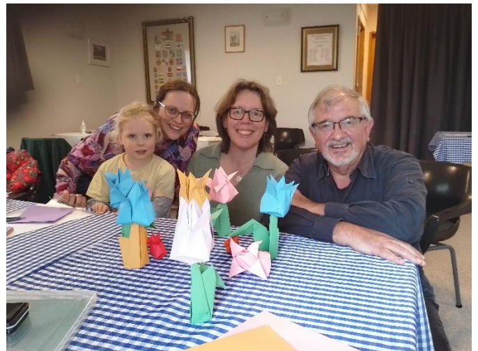
They stand up! Some a little 'wind-blown', perhaps.