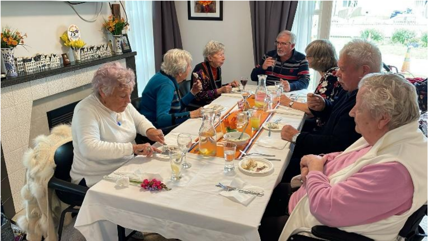
At the (co-)President's Table!

We had another good turnout for our annual commemoration of the liberation of Leiden with a traditional meal of herring, onion, white bread, and hutspot with meat, and of course a little dessert for afters. Thank you to all who helped make this a successful event again on Sunday 5 October!