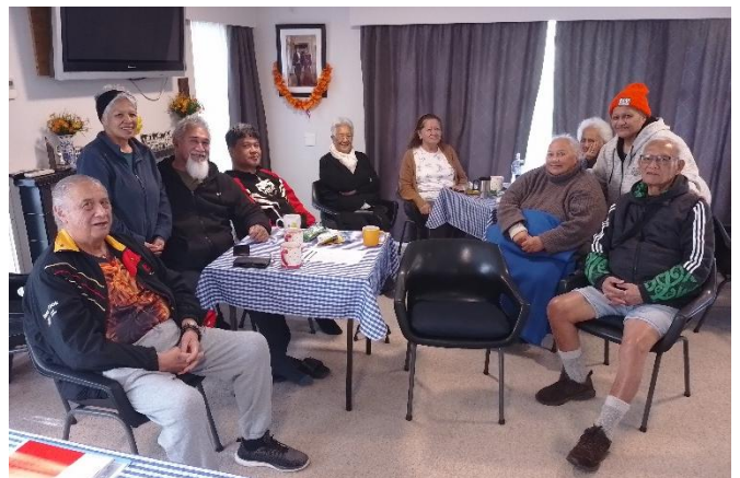
Members of Ngā Koeke O Ngā Hau e Wha enjoy the warmth of Avalon House on a July afternoon.

"The wairua here is very warm, very cosy. Now, it's been a home". This was the common feeling from those at the House. I told them the Dutch word for this was 'gezellig'.