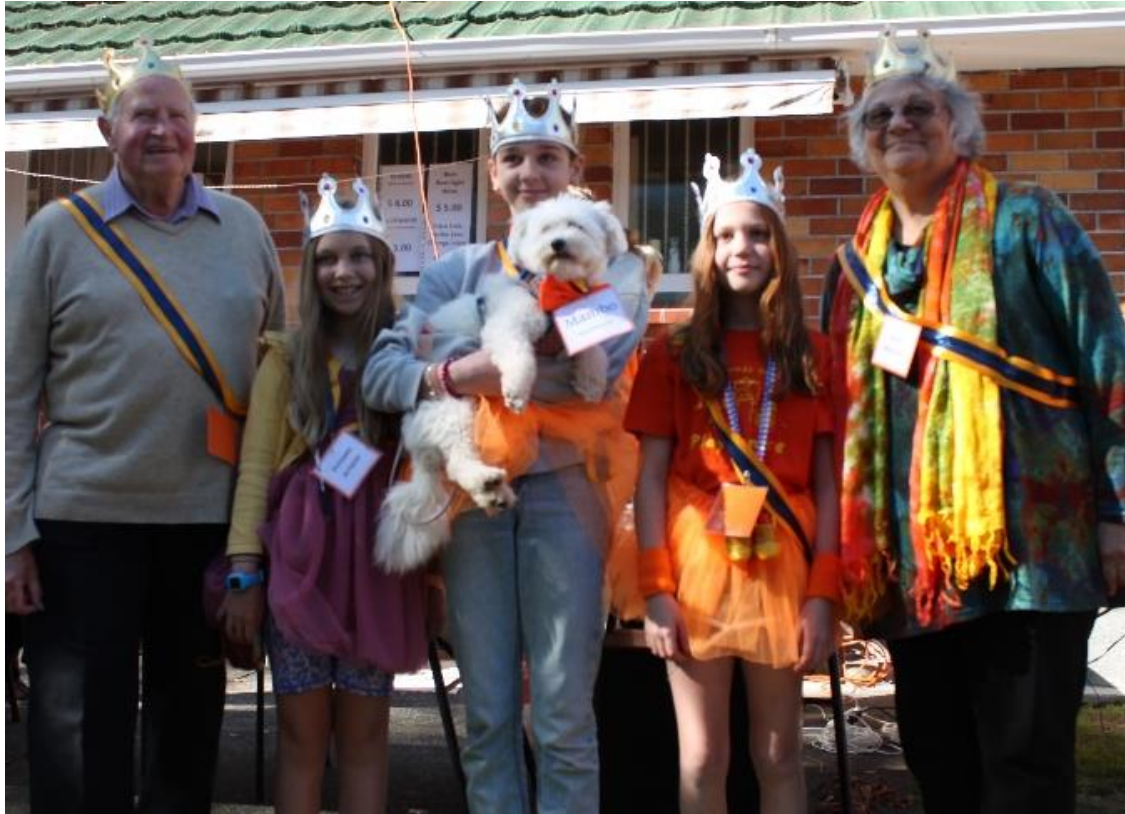
Dutch royals pop in for Koningsdag and it's 'on yer bikes' for Orange Bike 2024!