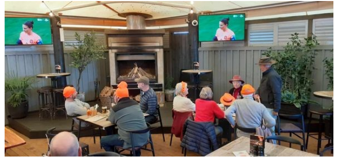
Watching the Dutch Team World Cup Soccer at Pig & Whistle