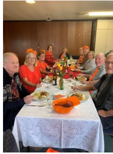
King's birthday Lunch and end of Dutch Week