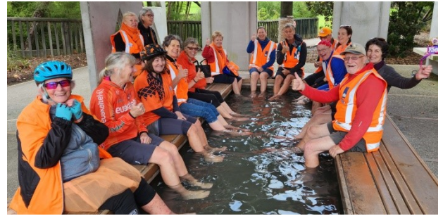
A nice warm footbath, midway of the bike ride