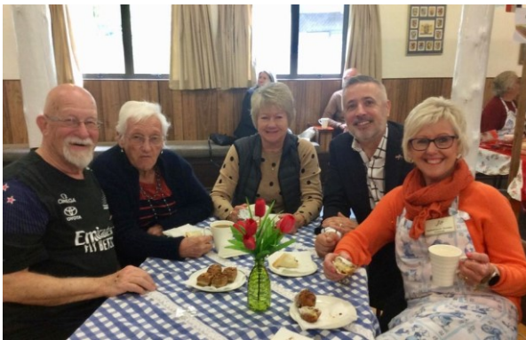
A visit from the Dutch Ambassador