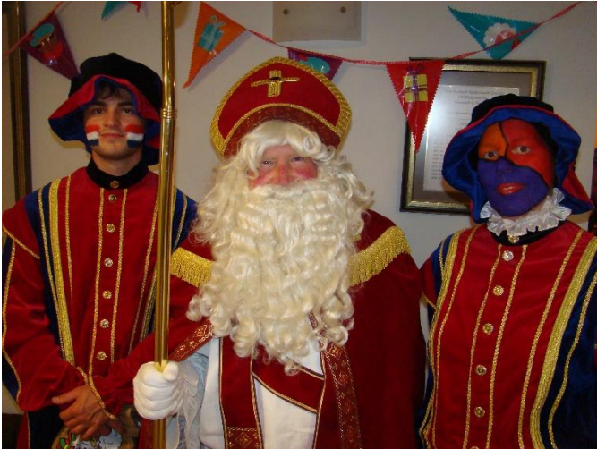
Pieten relaxing at the end of their long day!