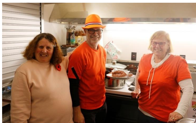
Thanks to all our much valued volunteers, in food preparation, sales, decorations, organisation, heating it all up in the kitchen – and just looking Dutch!