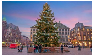
Dam Square Amsterdam