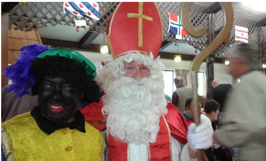
Sint and Piet

You will have plenty of time to get a family photo with Sint and Piet