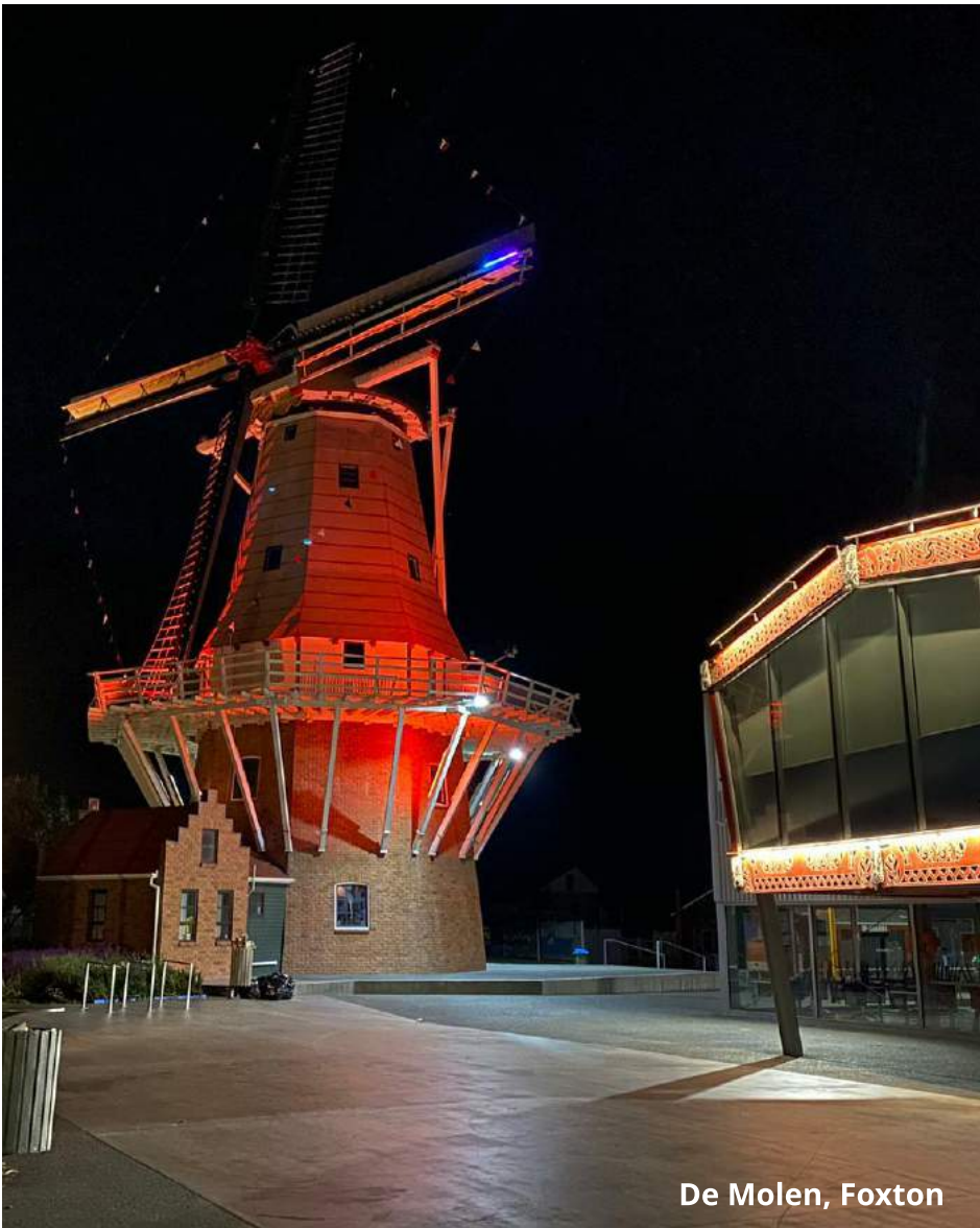
De Molen, Foxton