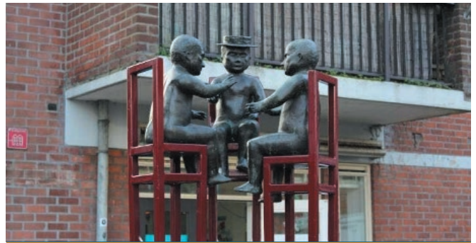
Placed in 1995, Three Dandies in Conversation is the newest sculpture of the bunch.

In Amsterdam's Oud-West you will find De Hallen, an old tram depot turned cultural hub that is full of impressive architecture and young entrepreneurs. The indoor food market Foodhallen is next to the movie theater Filmhallen.