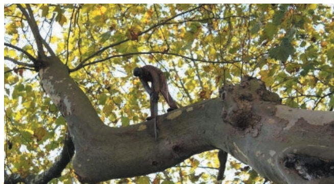
The Little Woodcutter is easy to overlook, sawing away on one of the tree's branches.

The woodcutter was placed in the night of then-Queen Beatrix's birthday. Begging for any of this to make sense, Amsterdammers jumped to the conclusion it was actually Her Majesty herself who had been behind these artworks.