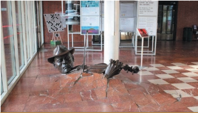
Right next to the entrance of Amsterdam's city hall, The Violinist has been playing since 1991.

"The Violinist" is the only indoor piece by the Unknown Sculptor. The sculpture was initially intended to be placed in the sea, rising and disappearing from between the waves. It found its way to the city hall in 1991 and hasn't left since.