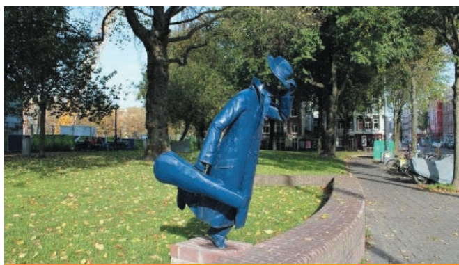
On Amsterdam's West Side, the Man with Violin Case continues to rush for the tram.

The first piece of work by the Unknown Sculptor appeared in 1982 in a location just outside of the realm of where a typical visitor would stray.