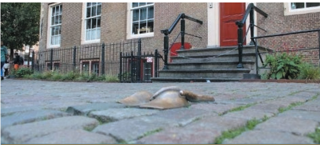
In the heart of the Red Light District, tucked away between the cobblestones, lies the mysteriously placed bronze breast plate.

After the sculpture appeared in February 1993, the city quickly removed it. Within a week it had appeared and disappeared again. Residents of the neighbourhood made complaints about the bronze piece of art. It was a noise nuisance, with people stepping on it or hitting it with stones. It was inappropriate, next to the church. It was plain sexist.