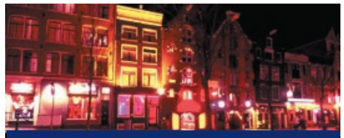
Red light district by night in Amsterdam.

One long-term project, if legal problems can be surmounted, is to limit the number of cheaper hotels and holiday rentals, with possible bans in central districts which have been overwhelmed by tourists. Hotels of "moderate quality" will be encouraged with grants to convert premises into homes or offices and the council will negotiate an agreement with the hospitality sector to set a maximum number of beds in the city.