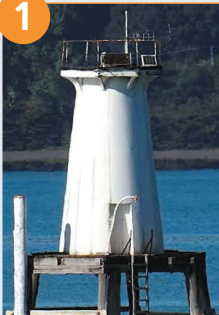
Shag Reef Range 2

Dit is de eerste keer dat wij hem hebben gezien en jullie misschien ook. Hij stond aan de ingang van Lyttelton haven.