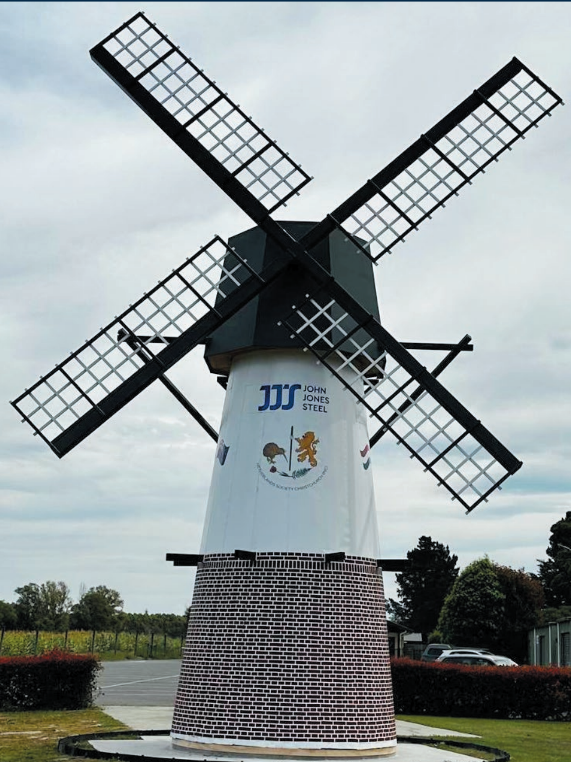
NSC Windmill.

Official Newsletter of the Netherlands Society Christchurch (Inc)