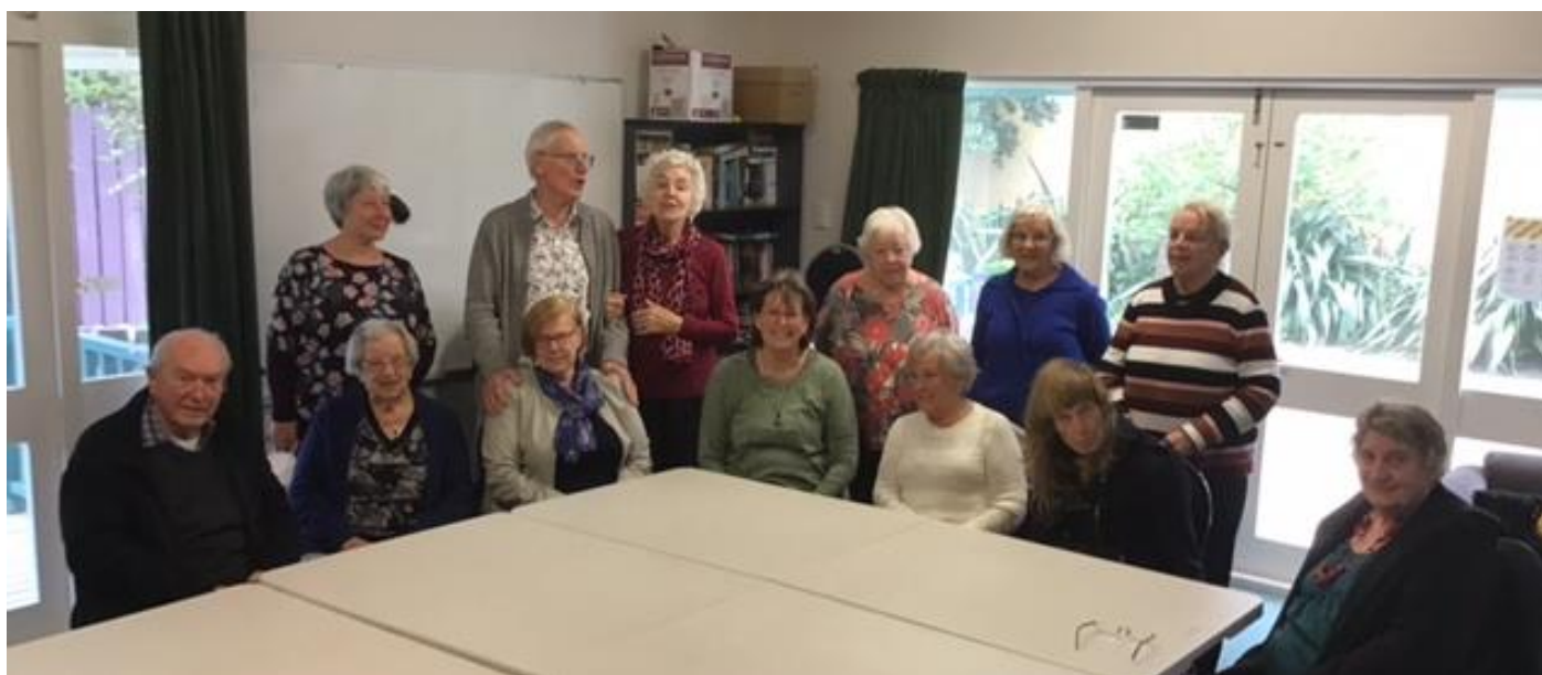
The Island Bay coffee group – no doubt after a 'gezellige koffiemorgen', and the tables had been cleared.