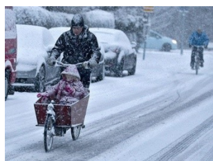
On the Bike in the snow