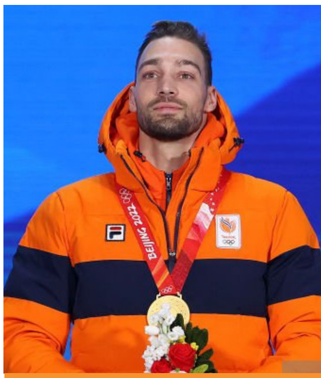
Gold medallist Kjeld Nuis wins gold in 1,500m speed skating.