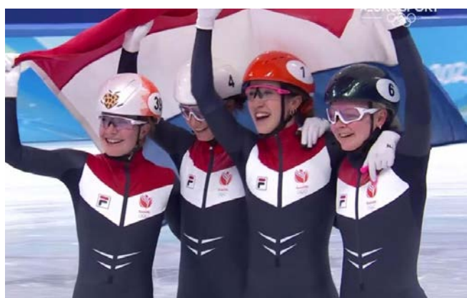
'An amazing display' - Netherlands celebrate gold in women's 3000m relay.