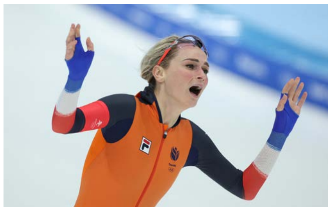
Speed skating-Schouten wins gold with Olympic record in women's 3,000m.