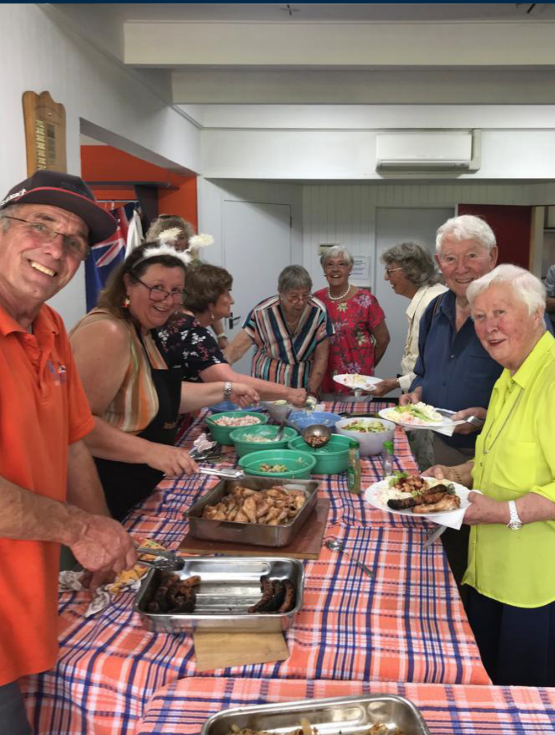
End of year BBQ 2021.