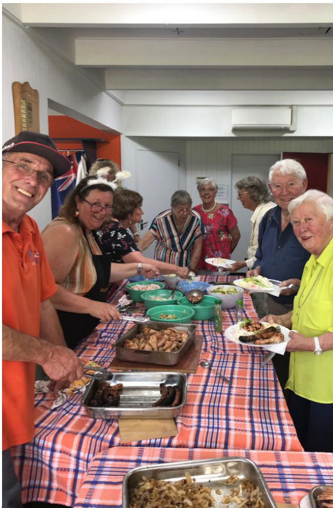
Everyone ready to eat the delicious, yummy meat from the BBQ.