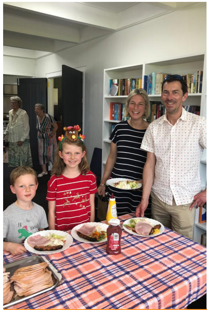
The best of family times at the Christmas BBQ.