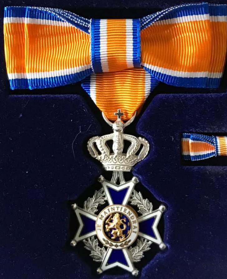
Medal for the Member in Order of Orange Nassau.