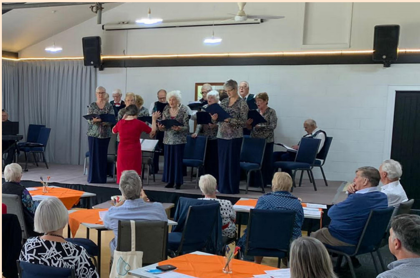
A captivated audience listens to the Neerlandia choir.

For more info please contact Annie: Ph: 383 1594 or mobile: 021 062 565