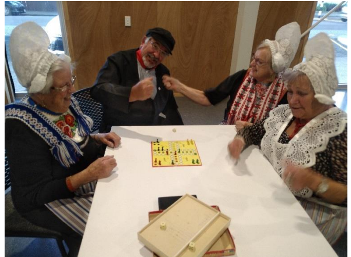
Playing (and losing) Mens Erger Je Niet

We had the use of a locked display cabinet for the week and filled it with some of the club's and our personal Dutch treasures. We certainly raised the profile of (some of) the Dutch in Stokes Valley!