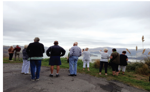
Overlooking the harbour and its amazing view from across the Sign Of The Bellbird.