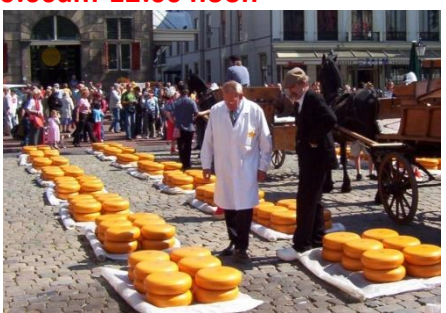
Saturday 10 APRIL Market Day 10:00am-12:00 noon