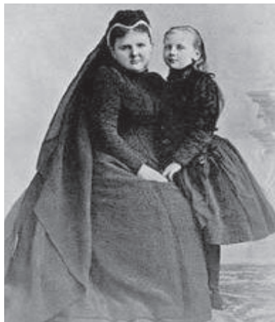
Koningin Wilhelmina en haar Moeder Koningin Emma

Koningin Wilhelmina werd, na de dood van haar vader, Koning Willem III in 1890 Koningin der Nederlanden op 10 jarige leeftijd. Omdat zij toen nog niet volwassen was werd haar moeder, Koningin Emma, regentes totdat Wilhelmina de 18 jarige leeftijd bereikte.