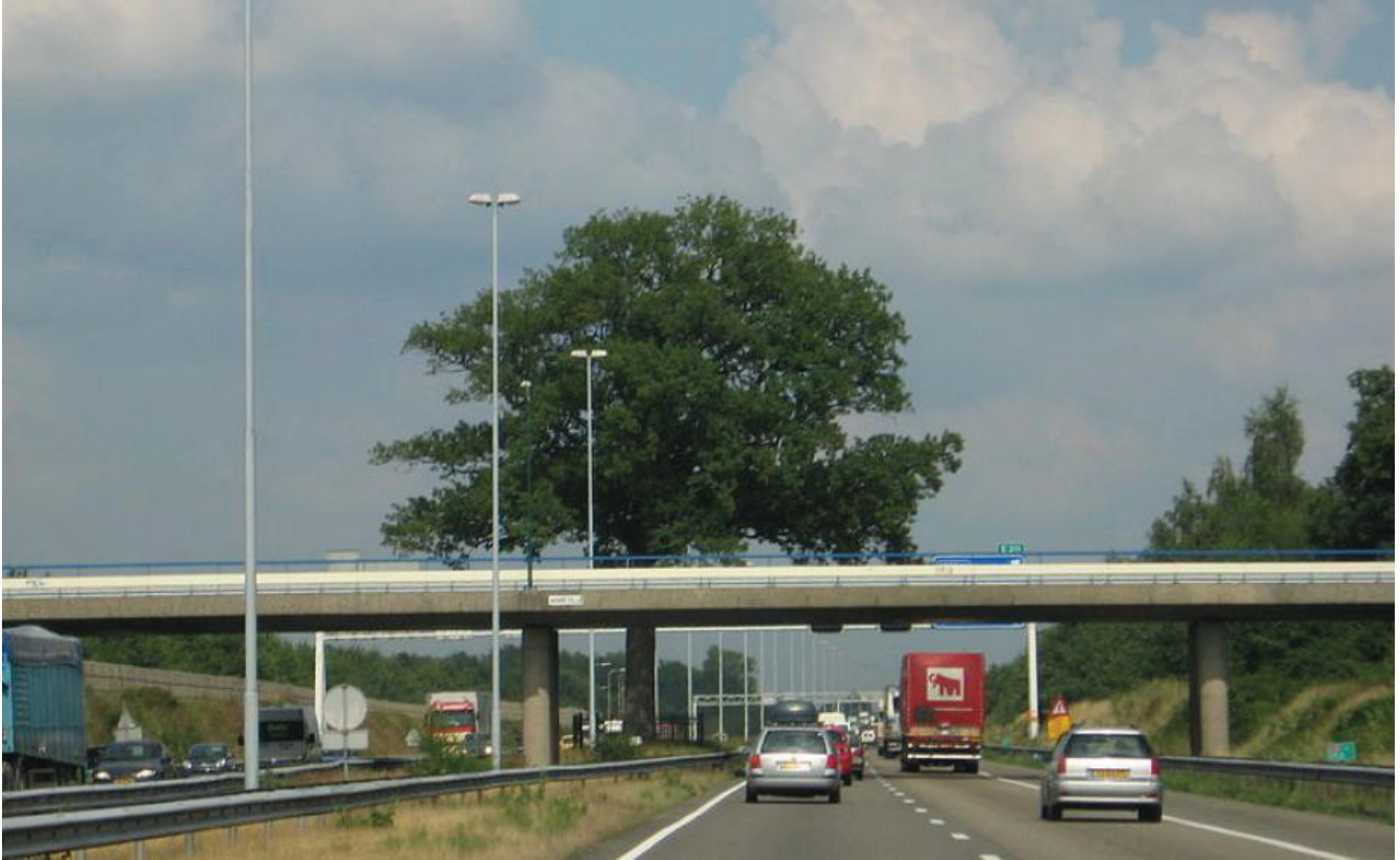
Oak tree in the middle of the A58 highway at Ulvenhout

The oak tree on the central divider of A58 highway in Noord-Brabant was elected the Tree Of The Year. A total of 2,834 people voted for the 'Troetel Eik' as it is affectionately known. The so called 'Troost Boom' on the estate Ter Worm in Heerlen came second place with 1,858 votes, NU.nl reports.