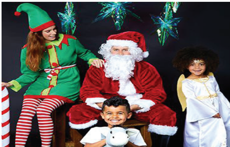
Santa and some of his little helpers!

Santa was alive and well....AND WE WERE ON HIS TEAM!