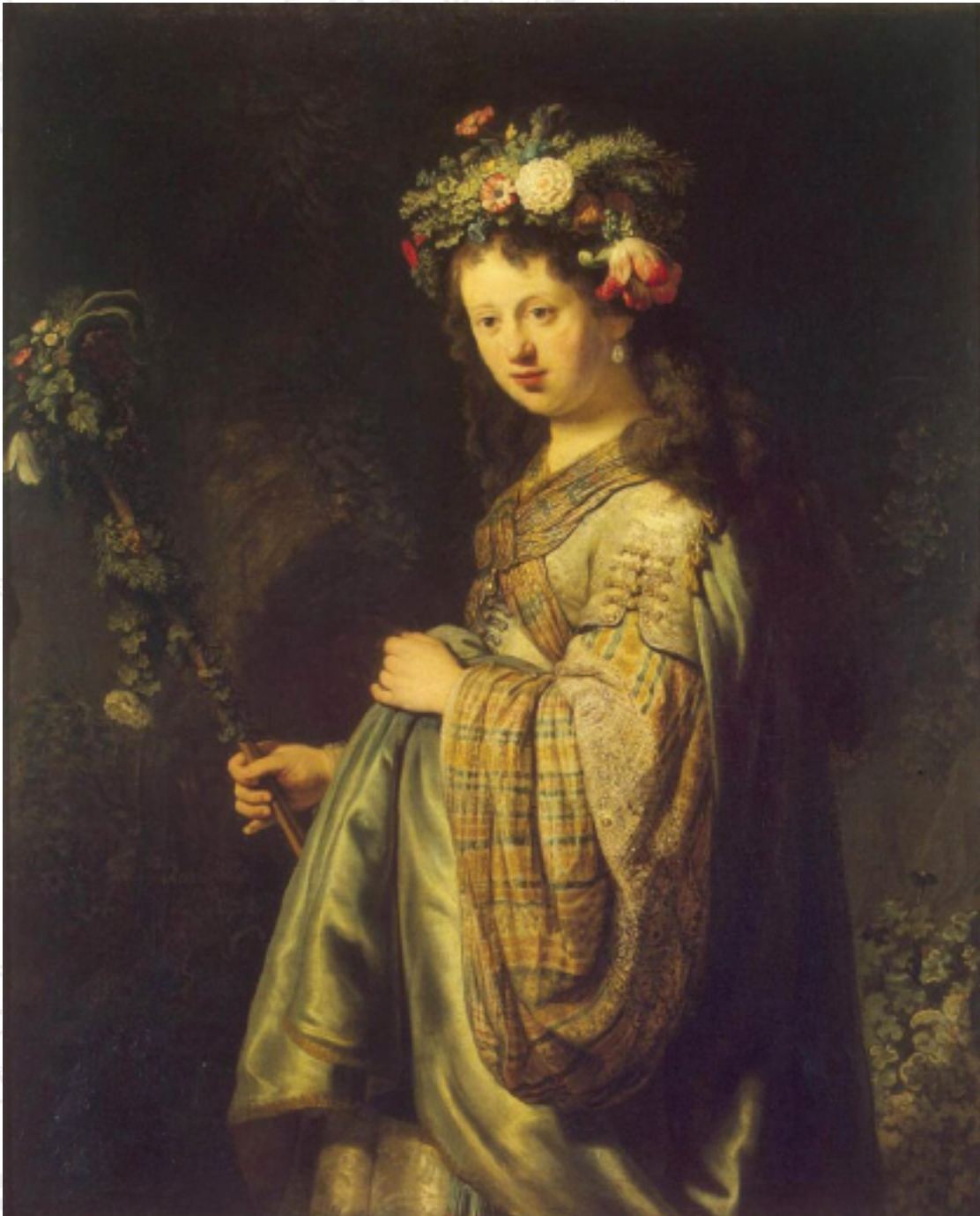
Saskia van Uylenburgh as the goddess 'Flora', by Rembrandt van Rijn in 1634