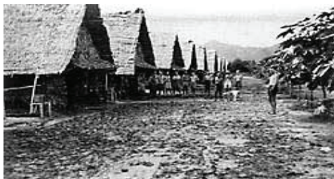
A typical POW camp on Thailand -Burma Railway

Later in life, he obtained his medical degree from the University of Leiden on a government grant in exchange for 10 years of service in the medical corps with the KNIL, the Royal Dutch Army. The first 6 months of service on Java was an intensive course of tropical diseases. With this combined knowledge, he later was able to save the lives and limbs of his fellow prisoners of war.