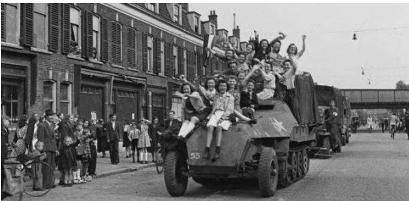
Op 5 mei werd Bevrijdingsdag gevierd.

Waaltdorpervlakte, waar vele verzets vechters werden neergeschoten.