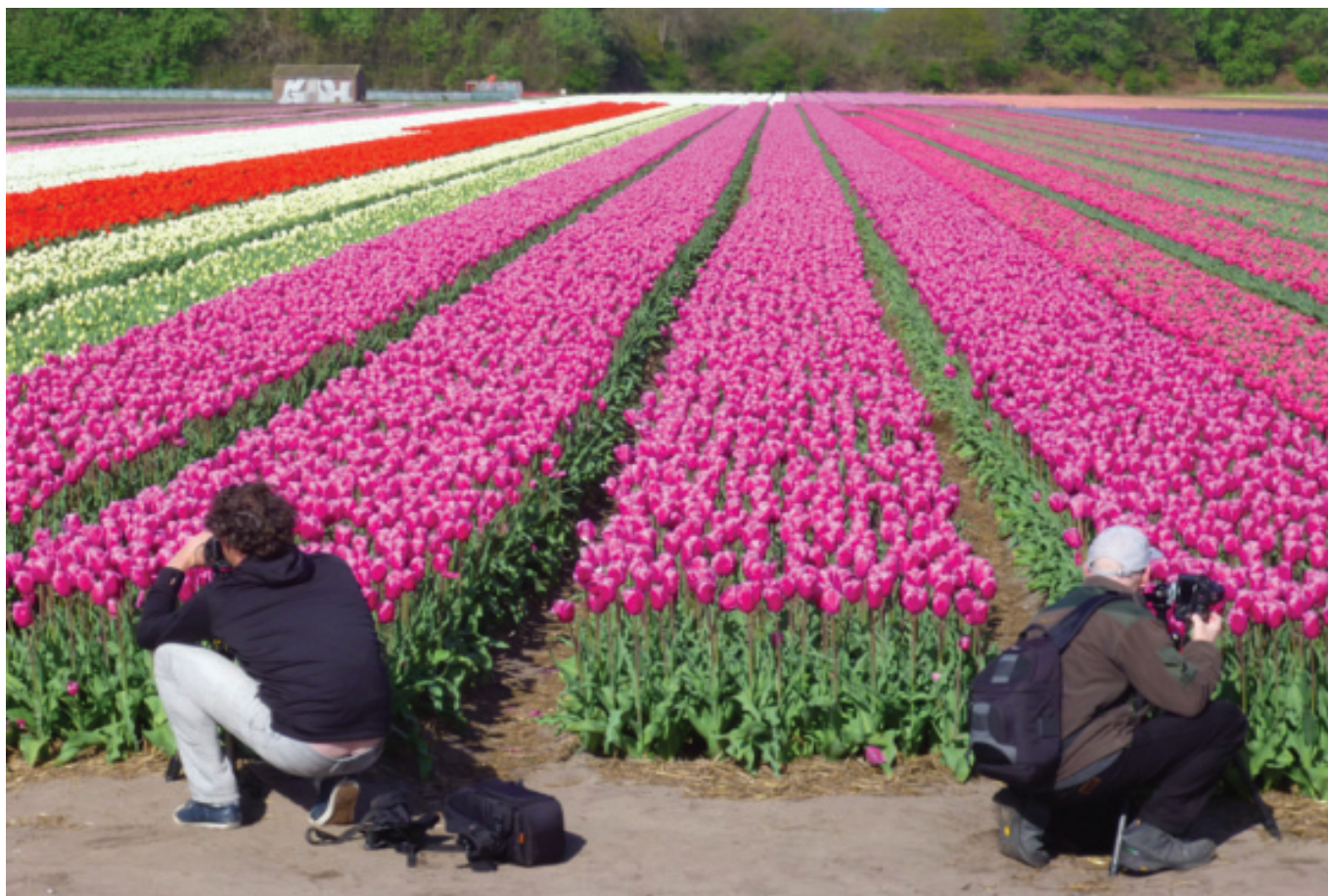
TOURISTS TAKING PHOTOS OF THE WORLD FAMOUS TULIP FIELDS.

Fewer growers are working the country's ever-expanding flower bulb fields, the national statistic office CBS reported last month.