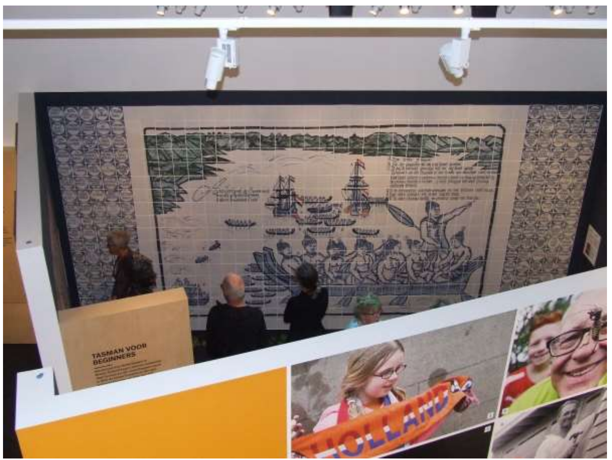
The Tasman Tableau, as seen from the mezzanine floor.